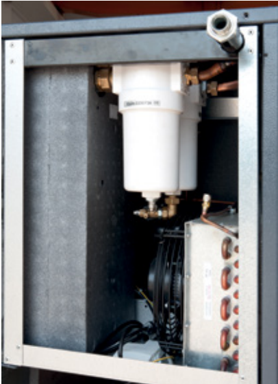
Valid for KSV range only